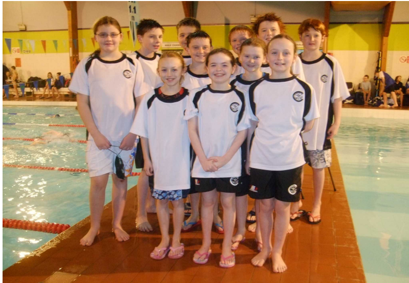
The Carnegie team pictured poolside at the North Ayrshire 200s

Ten swimmers from Junior Development competed at the annual North Ayrshire 200s meet. Swimming in events at 200m plus, some for the first time in competition, the whole team of swimmers set some superb lifetime bests, with some swims achieving Scottish National Squad selection times. There is a full meet report on the Competition section of the CSC website.